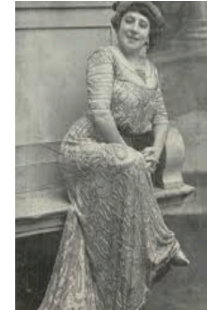
Pepita Sevilla.jpg - Wiki... commons.wikimedia.org