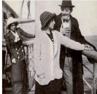
File:What Happened to Mary (1912) - 1 ... en.wikipedia.org