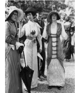
Women's fashion, 1912 Sto...