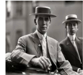
File:Bennet Champ Clark 1912.jp... commons.wikimedia.org