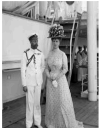
King George V and Que...