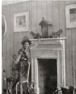
File:Ting-a-ling and the Cucko... en.wikipedia.org