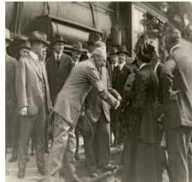
presidential election of 1912 ... britannica.com