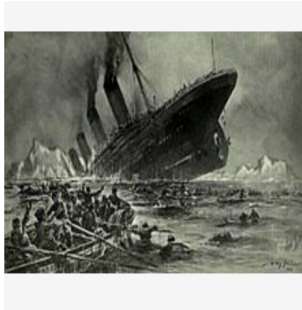
1912 - Wikipedia en.wikipedia.org