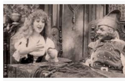
Robin Hood (1912 film) - Wikipedia en.wikipedia.org