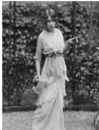
Women's fashion, 1912...