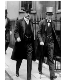
Winston Churchill in 19...